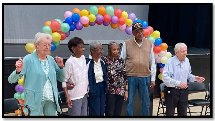
JASA VOLUNTEERS OVER THE AGE OF 90